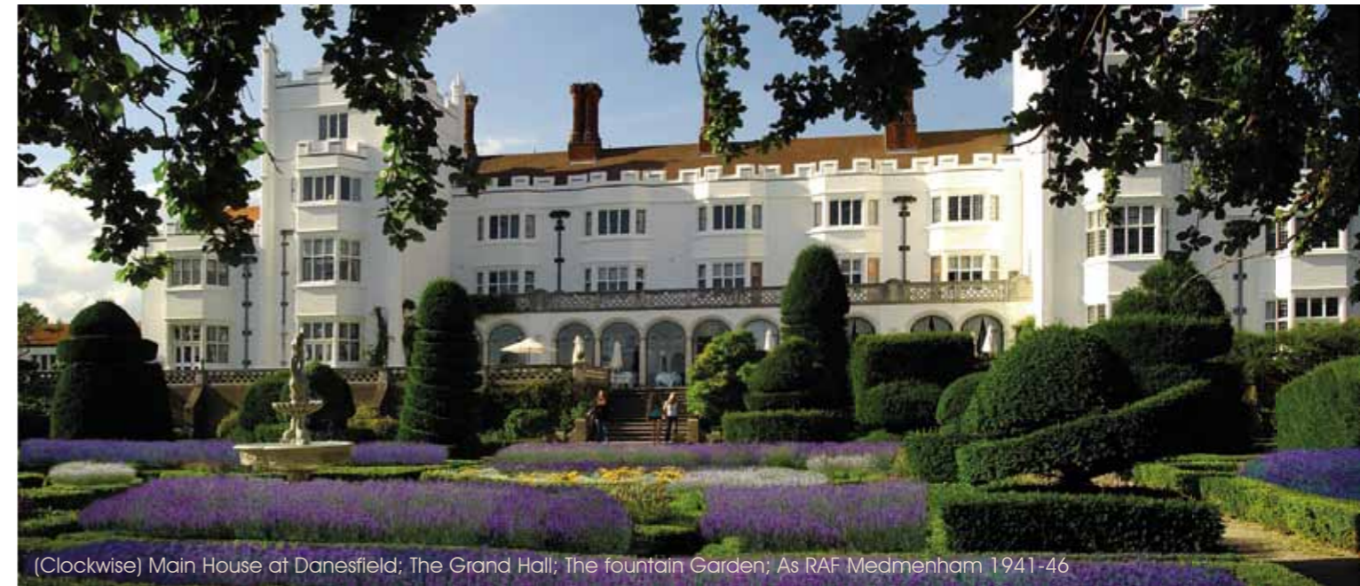
(Clockwise) Main House at Danesfield; The Grand Hall; The fountain Garden; As RAF Medmenham 1941-46